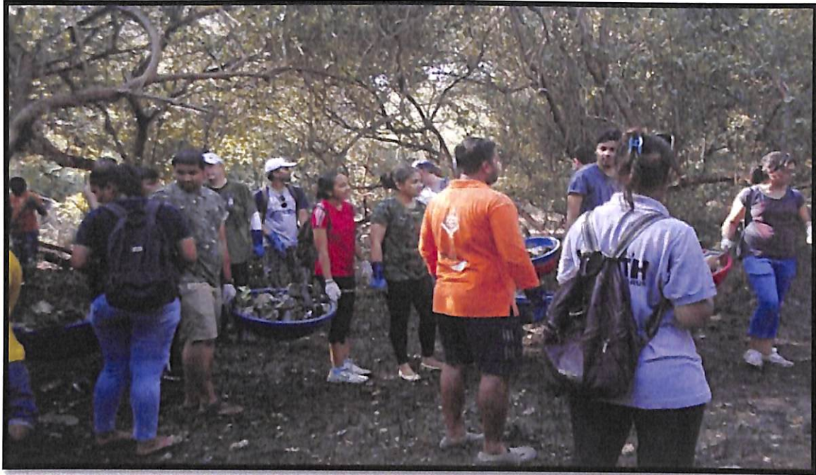
“Beach Clean Up on 29.08.2018”