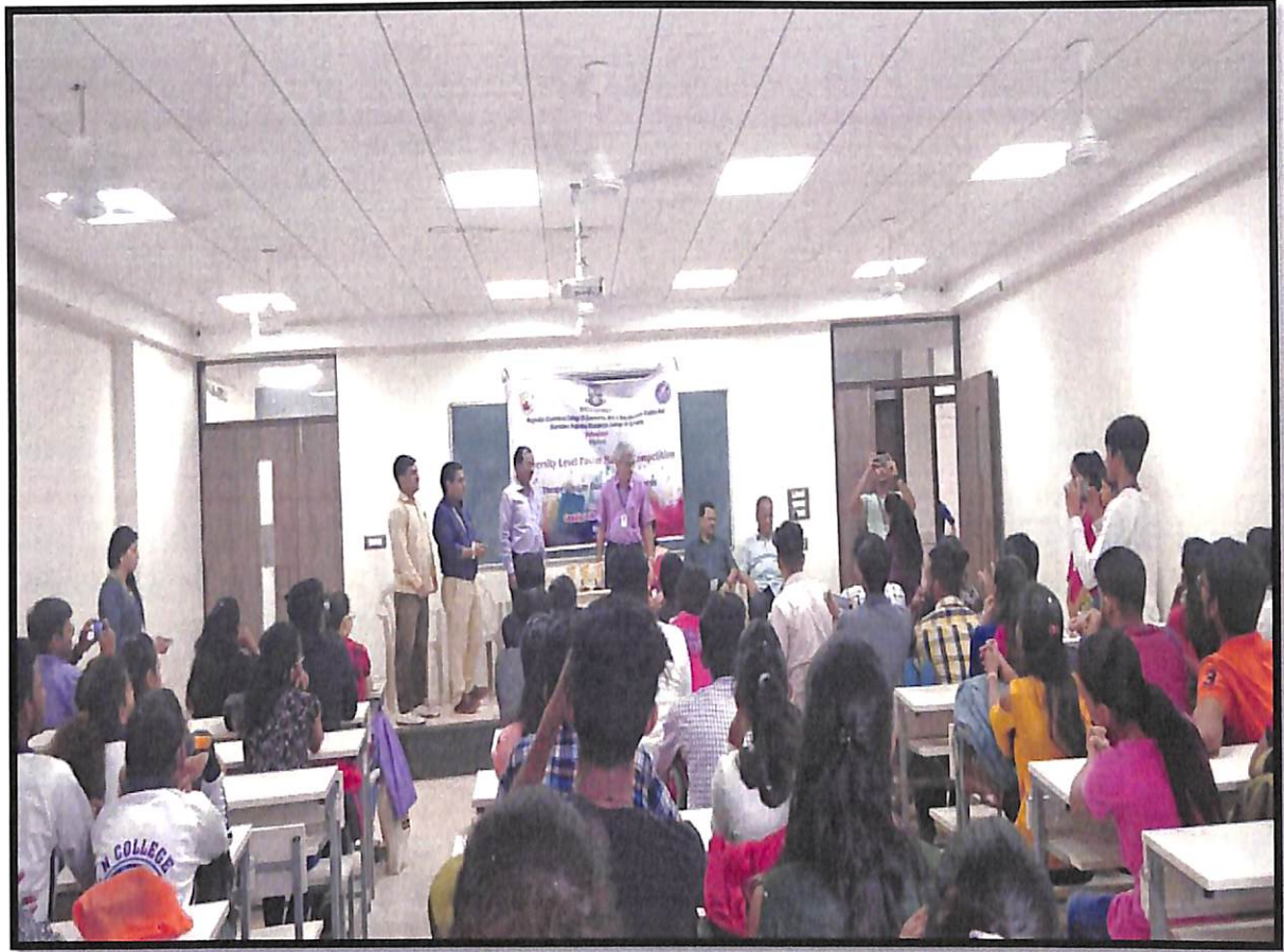
“University Level Poster Making Competition on 11.08.2018”