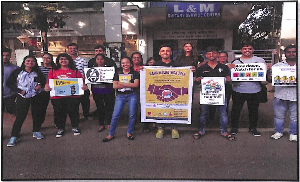
“Walkathon: Creating Awareness for No Honking on 02.10.2018”