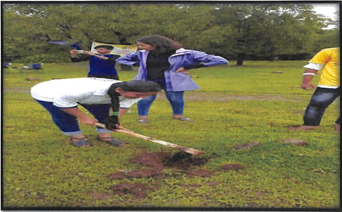
"Tree Plantation Drive on 06.07.2018"

Activity - 122 : The Students planted 128 saplings at Sanjay Gandhi National Park which included Karanj, Mahua, Jambul and Bamboo plants.