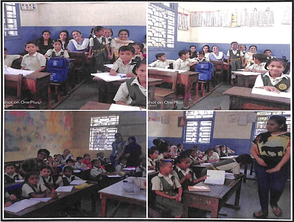
“English Teaching Activity on 05.07.2018”