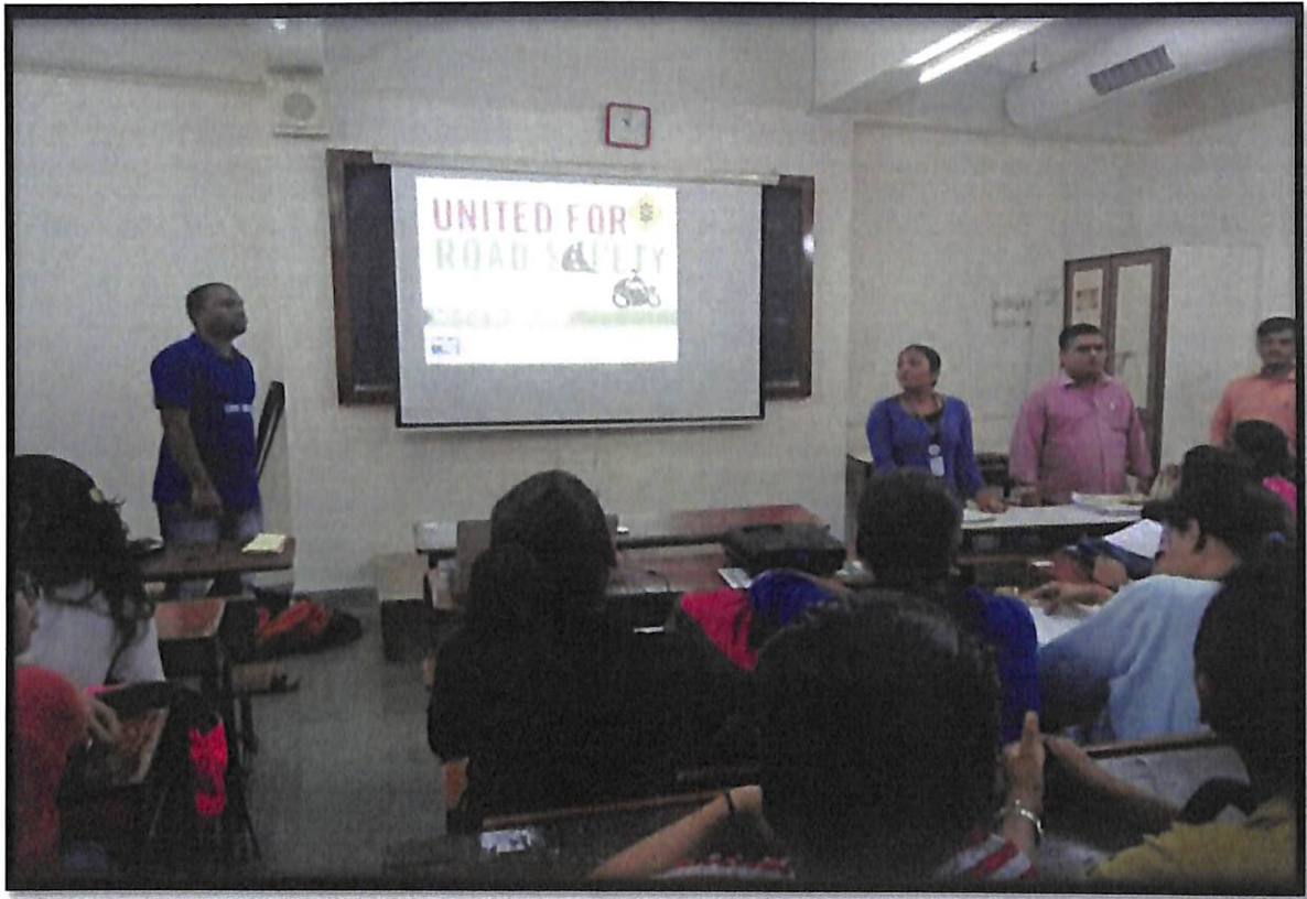
“Awareness for Road Safety on 19.07.2018”