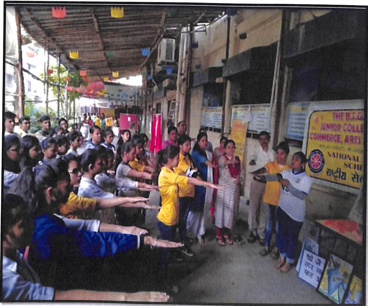
"Swatch Bharat Pledge on 30.07.2018"