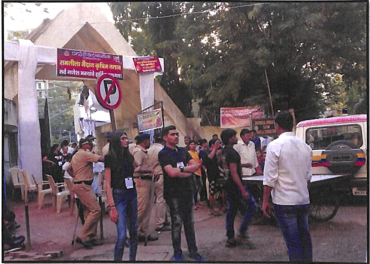
“Traffic Management on 23.09.2018”

Activity - 145 : Students helped the Mumbai police in traffic management during various days of Ganesh festival