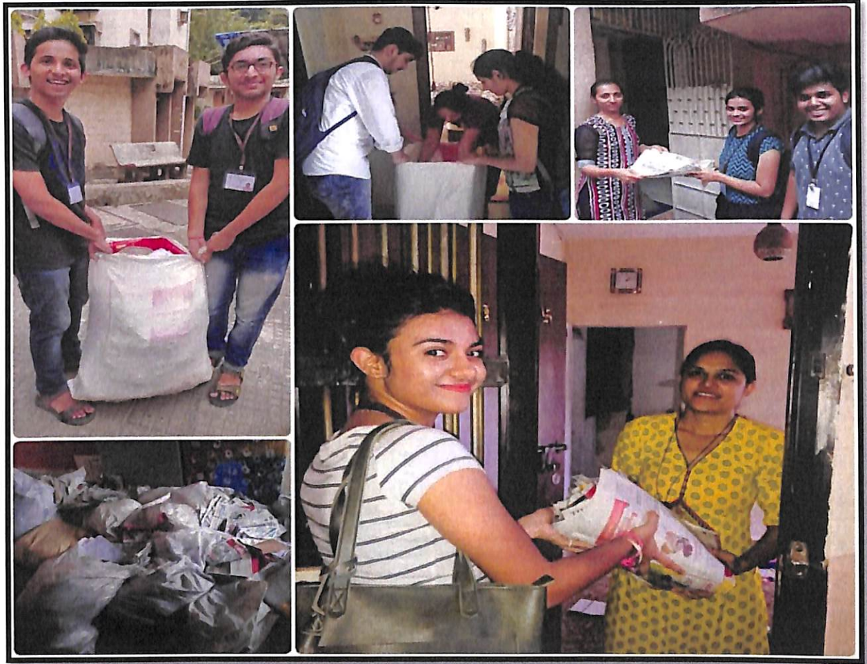
“News Paper Collection Drive on 29.09.2018”