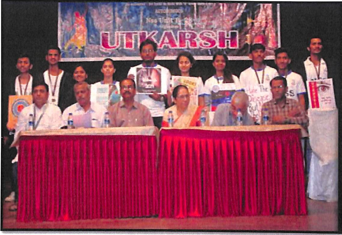
“Utkarsh: Intercollegiate Cultural Festival on 11.09.018”