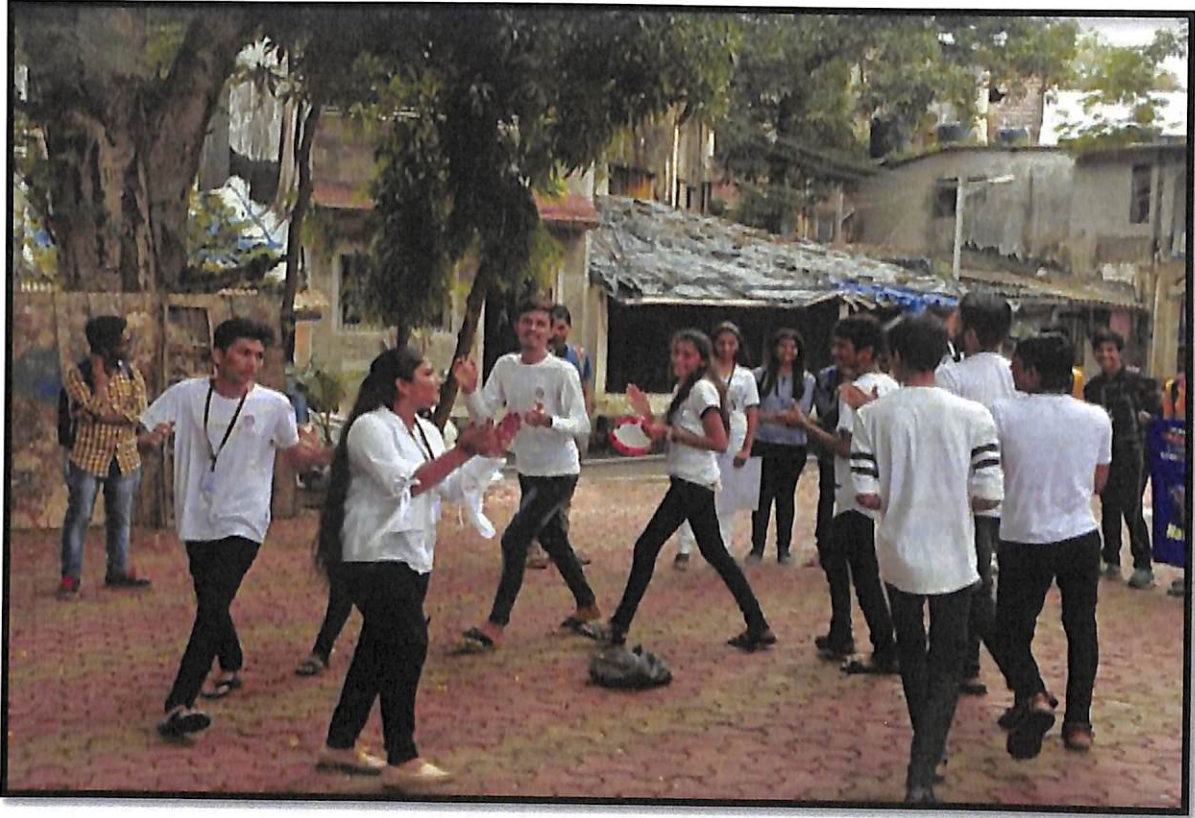
"Rally for Swatch Bharat Abhiyaan on 21.07.2018"