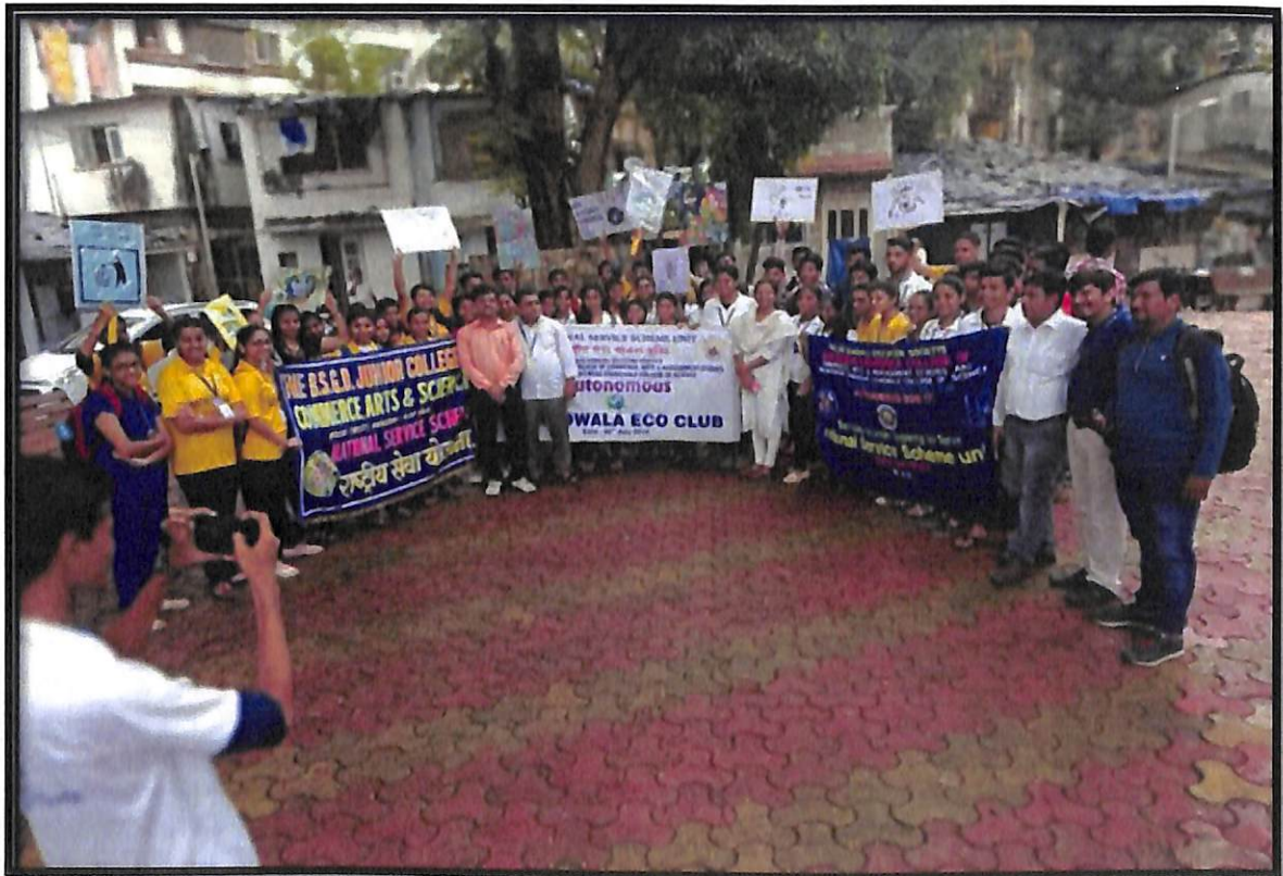
“Rally for Swatch Bharat Abhiyaan on 27.07.2018”